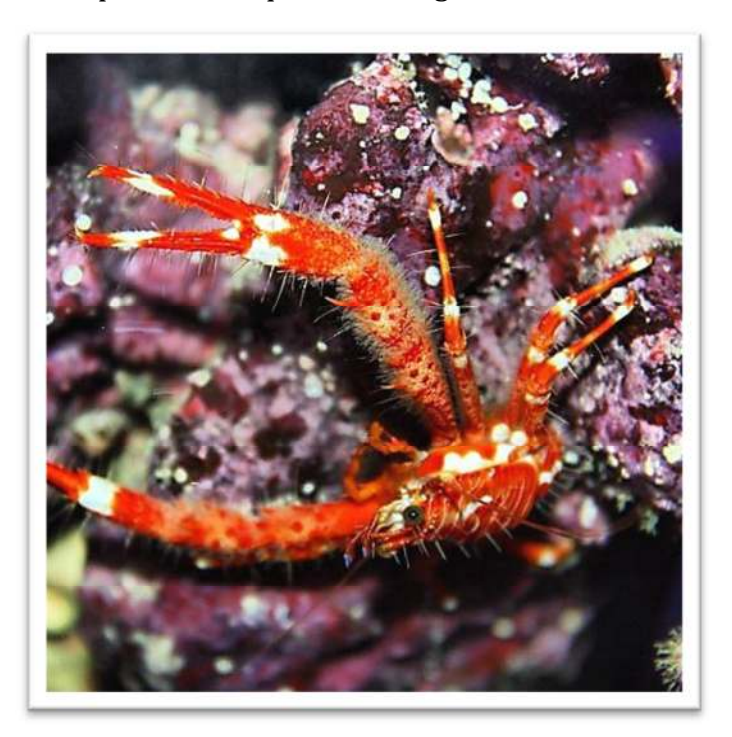
"Husbandry practices should be done in accordance with the biological needs of the animals we wish to keep."

I'm a true believer we must obtain as much information as we can to succeed in this hobby. None of us know everything, and listening to all ideas can only help us learn more. Do not just do or buy something without an explanation of why. A reputable source will be able to explain the advantages and disadvantages of a product or theory. Always remember;